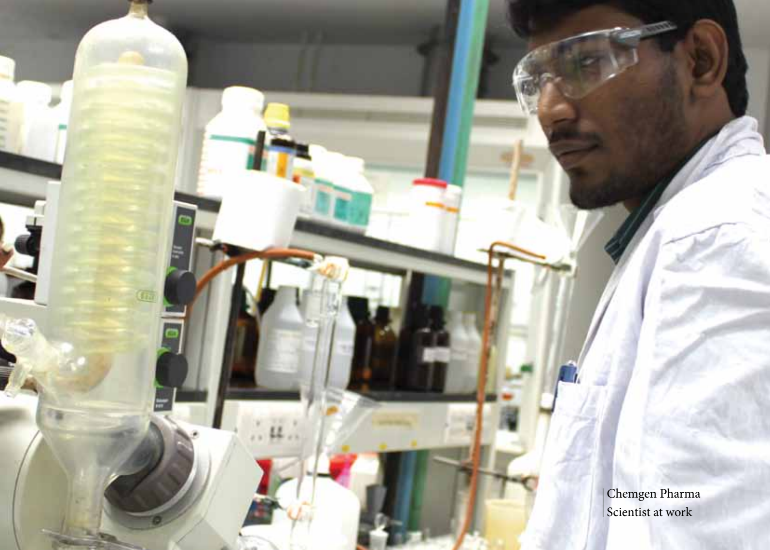
| Chemgen Pharma Scientist at work